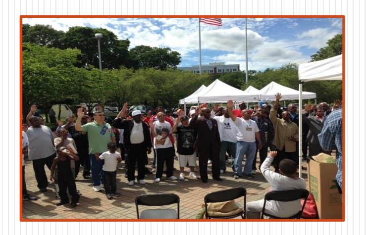
Boston Housing Authority, Boston, MA Fathers Take the Pledge!