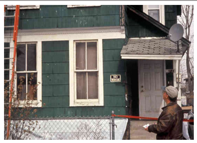
FIGURE 6.1 Visual Assessment.

The owner or owner's representative should perform, at least once a year, a visual assessment of each dwelling unit, each common area that is used by residents, exterior painted surfaces, and ground cover (if control of soil-lead hazards is required or recommended) (see Figure 6.1). Visual assessments should also be conducted when the owner or management receives complaints from residents about deteriorated paint or other potential lead hazards, when a dwelling turns over or becomes vacant, or when significant damage occurs that could affect the integrity of hazard control treatments (e.g., flooding, vandalism, fire).