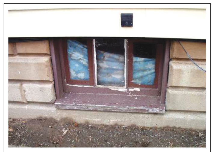
FIGURE 6.3 An area of bare soil beneath a window with deteriorated paint.

Bare soil means soil or sand not covered by grass, sod, other live ground covers, wood chips, gravel, artificial turf, or similar covering. (24 CFR 35.110) (see Figure 6.3)