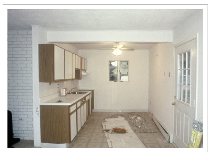
FIGURE 6.5 Unit turnover is an excellent time to conduct the visual assessment and perform lead-safe maintenance activities.