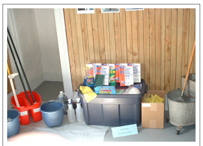
FIGURE 6.6 Clean-up supplies.

phosphate content is not associated with effectiveness in removing leadcontaminated dust from residential surfaces (EPA, 1997a; EPA, 1998). When cleaning floors, workers should have three buckets: one for the cleaning solution, one with a mopsqueezing tool, and one with clean water for rinsing the floor. For floors, the mop should be a string mop; sponge mops work more as a sweeping tool since it has less surface area to trap dust than string mops. Rags and sponges are recommended for cleaning walls, interior window sills, window troughs, counters, shelves and other horizontal surfaces.