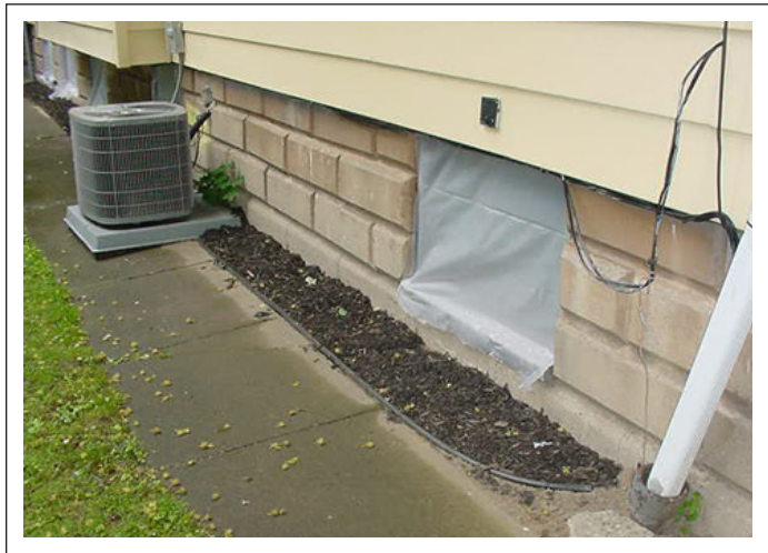
FIGURE 6.4 Bare soil in Figure 6.3 covered with mulch (the window was sealed during the process of controlling the bare soil).

Test the sand and, if it is a hazard, replace it with sand with lead content of less than 200 μg/g if possible (this is best practice) but certainly less than 400 μg/g, which is the EPA requirement;