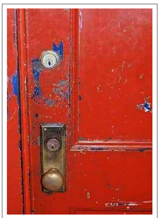
FIGURE 1.3 Paint deterioration.

Because the greatest risk of paint deterioration is in dwellings built before 1950, older housing generally commands a higher priority for lead hazard controls ( see Figures 1.2 and 1.3 ). (See Chapter 5 for lead-based paint prevalence data by building component type and prevalence of housing with significant lead-based paint hazards by year of construction.)