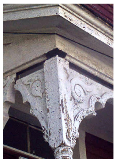
FIGURE 1.2 Deteriorated residential paint on house trim.