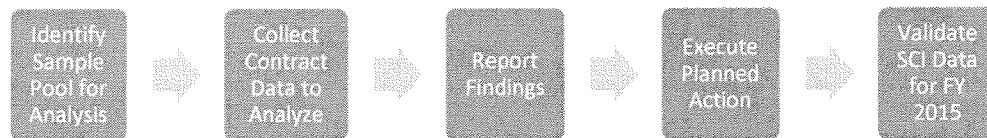
Figure 1: Analysis Process

To validate this review, HUD utilized tasks annotated in the Statement of Work (SOW) and/or Performance-based Work Statement (PWS) against FAR Subpart 7.5 to determine if the contractors were performing inherently governmental functions. HUD assessed labor categories to determine whether a program or project manager was included as part of the technical approach. Additionally, the coding associated with inherently government functions, found in the description of each identified FPDS record, was compared to the contract terms and conditions to ensure accuracy in reporting. Finally, pursuant to FAR Subpart 4.17, HUD reviewed the System for Award Management (SAM) to ensure the contractors' information on the amount invoiced and the direct labor hours expended on covered service contracts had been entered appropriately.