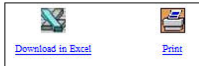
Figure 3: The options for further use of report data

Note: For best results, print in landscape orientation.