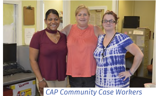
CAP Community Case Workers

Community Action Agencies (CAPs) serve all 39 cities and towns in Rhode Island. CAP agencies have various missions and goals to end poverty and offer a range of housing stabilization programs to address our community's housing needs. Several programs offer support to people with mental health and/or substance use concerns. In addition to heating programs, you will find CAPs provide community food pantries, tax assistance, rental and mortgage assistance, education services, home visiting programs, support, children's health services, and many other programs for Rhode Island residents in need.