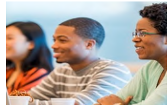
PCF Development Homeownership Class

Do you want advice on buying a home, renting, default, foreclosure avoidance, credit issues or reverse mortgages? HUD sponsors housing counseling agencies throughout the country to provide free or low-cost advice. Search online for a housing counseling agency near you or call HUD's interactive voice system at: (800) 569-4287 . If you are facing foreclosure and want the assistance of a housing counselor, search the list of Foreclosure Avoidance Counselors HUD Sponsored Housing Counseling Agencies in RI.