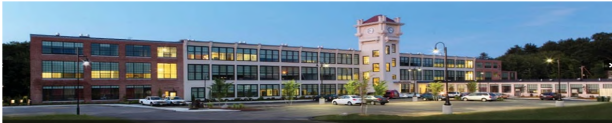
(above photo) [Clock Towers] in Harrisville, RI. Click photo to visit NeighborWorks Blackstone River Valley website www.nwbrvproperties.com .