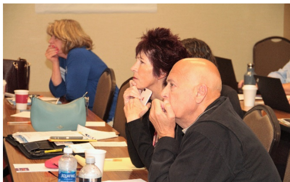
Figure 21: Workshop participants listen to ideas for economic recovery and resiliency

The workshop was attended by 51 participants representing community, regional, state, federal, and private sector interests.