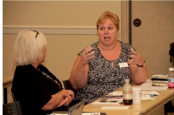
Figure 27: Workshop participant discusses her experiences in North Naples