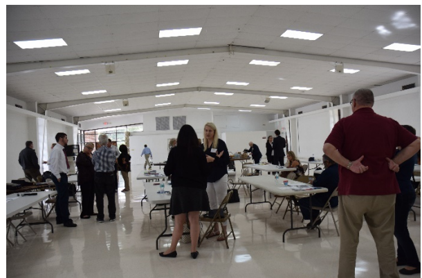
Figure 11: Participants network with each other during a break