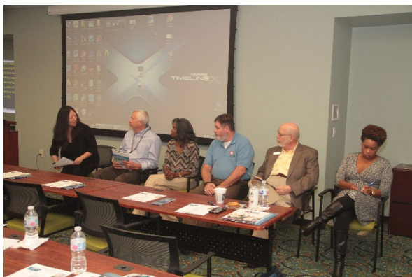
Figure 18: A panel of federal partners discuss priority needs and resources for economic recovery and resiliency

The workshop was attended by 29 participants representing community, regional, state, federal, and private sector interests.