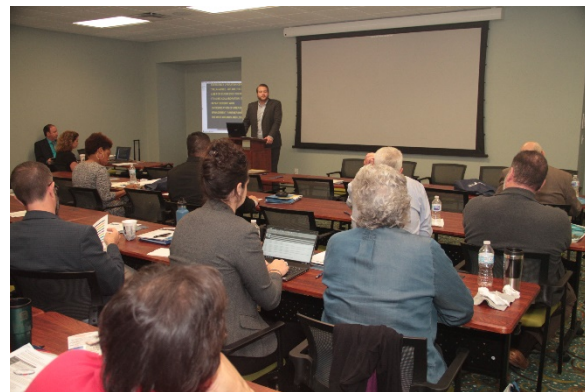
Figure 19: DEO's Grey Dodge shares information on state resources