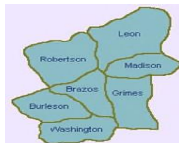
Brazos Valley Region

U.S. Department of Housing and Urban Development ( HUD ) Resource Locator ( https://resource.hud.gov/ ) was compiled to assist low-moderate income families locate DECENT, SAFE, and AFFORDABLE rental housing and other associated resources. HUD provides funding for the various housing complexes and entities listed in this directory. However, HUD does not administer these programs directly. Persons seeking housing or services MUST apply directly to the Housing Authority, Apartment complex and/or the entity listed within this guide.