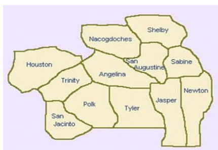
Deep East Texas Region