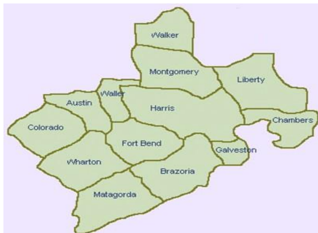
Houston-Galveston Area Region