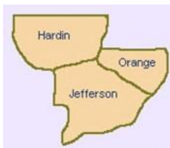
Southeast Texas Region