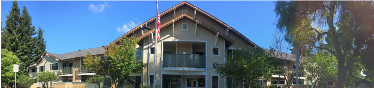
Bracher Gardens Apartments

In 1967, the Santa Clara County Board of Supervisors established the Santa Clara County Housing Authority (SCCHA). SCCHA has an agreement with the City of San José to administer and manage the Housing Authority of the City of San José (HACSI)'s Housing Choice Voucher program. This MTW Plan presents a consolidated strategy to be implemented for both the County and City programs.