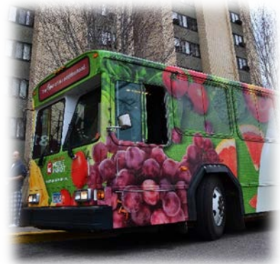
Twin Cities Mobile Market

Along with 12 senior-designated buildings, MPHA continued its pioneering assisted-living and memory care facilities in partnership with AugustanaCare. The multiple tenant-partners at our Cora McCorvey Health and Wellness Center serve many of our senior public housing residents in ways that improve well-being and independence. Volunteers of America social workers are embedded throughout our highrise buildings to offer on-site assistance with crises and assistance in navigating community resources. In 2017, a grocery-on-wheels, the Twin Cities Mobile Market, began weekly visits to multiple MPHA highrises. Other partners provide support for residents with mental illness (Touchstone Mental Health), and engagement of our young people (Girls in Action). We have been working with the City of Minneapolis Health Department for materials and support as we take the non-highrise portions of our public housing smoke-free in 2018 (MPHA implemented smoke-free policies in highrise housing in 2015).