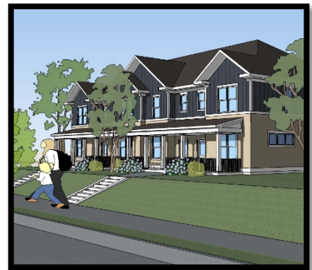
Rendering of the Minnehaha Townhomes

The year 2017 brought great progress for our “Shelter to Home” MTW activity, under which MPHA will build 16 townhome units dedicated to families emerging from homelessness. In partnership with the City of Minneapolis, MPHA obtained a one-acre lot in a desirable location with excellent access to transit, has agreements in place to fund and deliver services to families, and has raised near $4 million toward this initiative by working intensely with city, county, state, and private funders. We are hopeful the Minnehaha Townhomes will demonstrate MPHA's commitment and its capacity to develop and redevelop in pursuit of our mission.