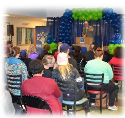
Downtown View groundbreaking

In 2017 MPHA celebrated the groundbreaking and later the opening of a Minneapolis transitional housing facility for homeless youth. The facility, called “Downtown View,” is run by local partner Youthlink, with services provided by Project for Pride in Living (PPL). MPHA made this project possible with our commitment of 25 project-based vouchers under our “Permanent Supportive Housing for Youth” initiative.