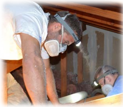
Crews blow in cellulose attic insulation at MPHA's Glendale Townhomes, through a partnership with Sustainable Resources Center (SRC) and CenterPoint Energy.

Although our available funding falls far short of our need, MPHA invested $13.5 million dollars in capital projects across our portfolio in 2017—in part by using our MTW single-fund-flexibility to address urgent safety and security priorities. The agency directed our limited capital dollars toward repair and upgrade of fire suppression and alarm systems; elevator modernization; piping, heating, and electrical systems repair; and roof replacements at our scattered-site homes. Two buildings long-due for apartment renovations received major updates. By working with partners, MPHA also pursued and secured U.S. Department of Energy funding to perform major weatherization and energy-efficiency upgrades for our oldest major property, the Glendale Townhomes. This work, begun in 2017, will provide all 184 family units with new insulation, updated ventilation systems, and furnace repairs. We estimate the investment may total more than $1.5 million, bringing comfort to residents and energy savings to MPHA.