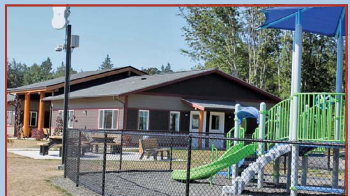
Private counseling offices overlook the playground.