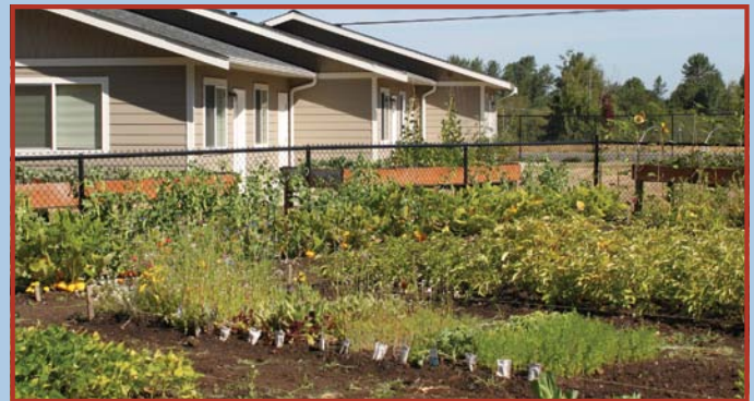
The community garden offers elders an opportunity to pass on traditional methods of canning and storing food.