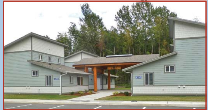
A shared covered alcove encourages families to get to know and support one another.