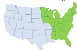
Eastern Woodlands Region

Please share with others who may be interested in the EWONAP News Bulletin. Click Here to sign up.