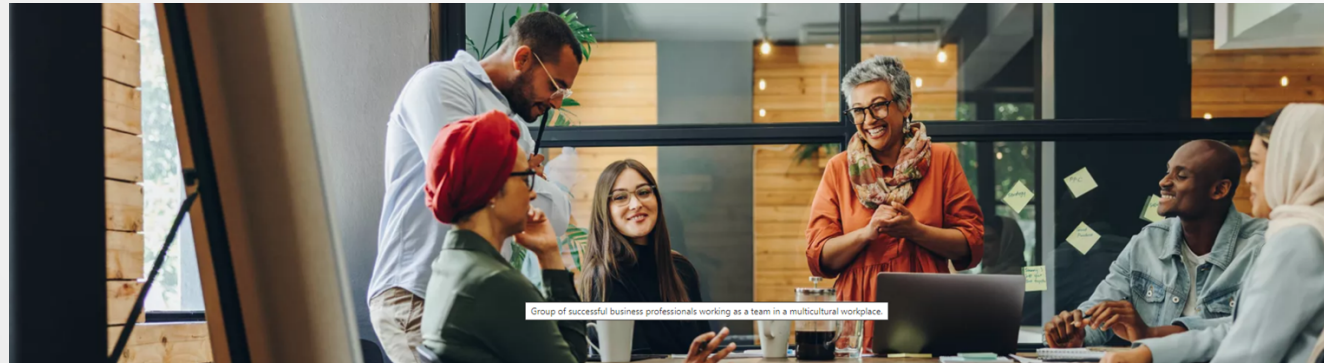
Group of successful business professionals working as a team in a multicultural workplace.