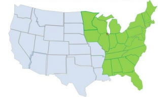
Eastern Woodlands Region

Please share with others who may be interested in the EWONAP News Bulletin. Click Here to sign up.