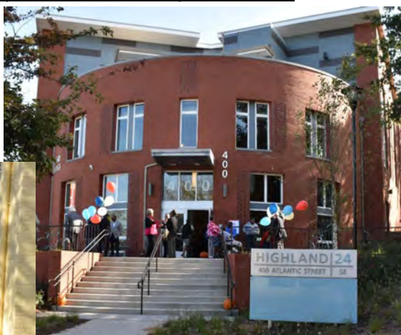
Highland Dwellings Community Center