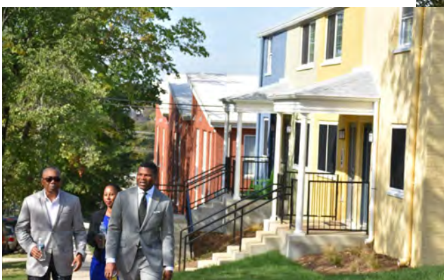
New Units at Highland Dwellings

In FY2017, DCHA completed the modernization/construction of 77 units at Highland Dwellings, for a total of 208 units of affordable housing preserved on the Highland footprint as a result of DCHA's MTW authority.