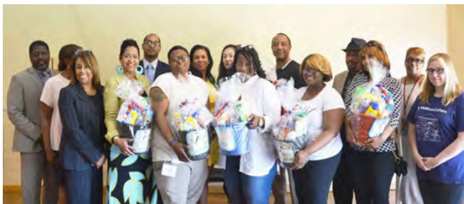
FY2017 HCV Homeownership Appreciation Event

DCHA has implemented a more comprehensive and coordinated approach focused on facilitating access to services/resources that meet the individual needs of residents and provide incentives for residents to work toward attaining self-sufficiency. The following outlines some of DCHA's efforts in this area: