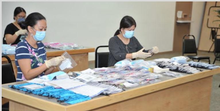
The Hawaii PHA made reusable masks for elderly and disabled residents.