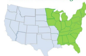
Eastern Woodlands Region

Please share with others who may be interested in the EWONAP News Bulletin. Click Here to sign up.