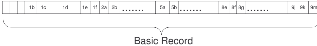
Figure 1.3 Data Field Layout in Basic Record

As illustrated in the Edits and Validation section, every record starts with a record identifier field and a record number data field. In the Basic Record, the third data field is Date Modified with no line number in the Form HUD-50058. All other fields are sequentially laid out in the record and identified by corresponding field line numbers in the Form HUD-50058.