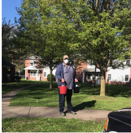
Rockford Village EnVision Center distributed cleaning supplies to the community.