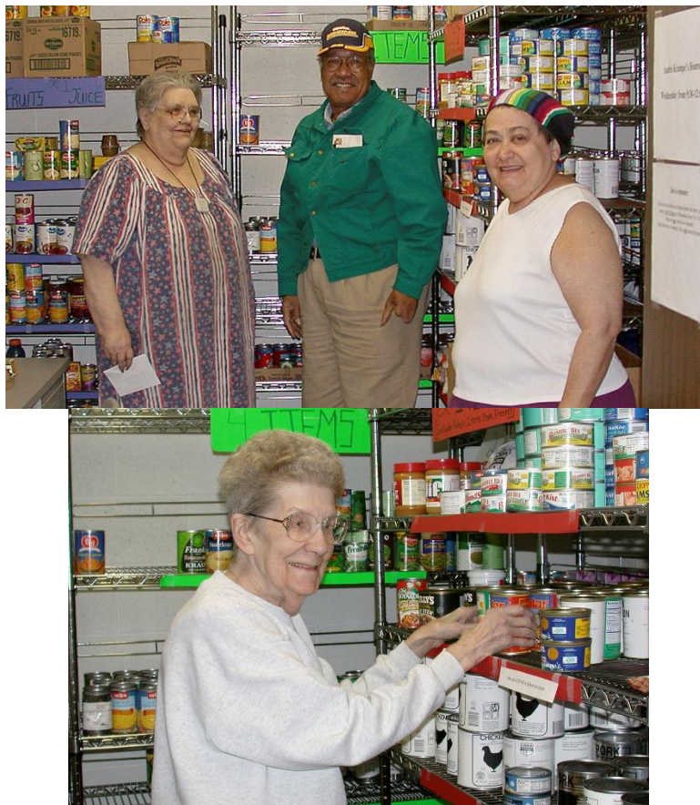
North End Community Ministry continues to donate to the Leonard Terrace Apartments food pantry to help the community.

Furthermore, Kids' Food Basket is providing sack lunches three times a week at the GRHC's Creston Plaza Community Center and at the Campau Commons Community Center to assist the young residents of the family housing developments, many of whom rely on the school meal program to meet their nutritional needs. Read more from M Live