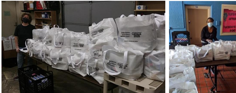
The donated bags also included U.S. Census Bureau information.