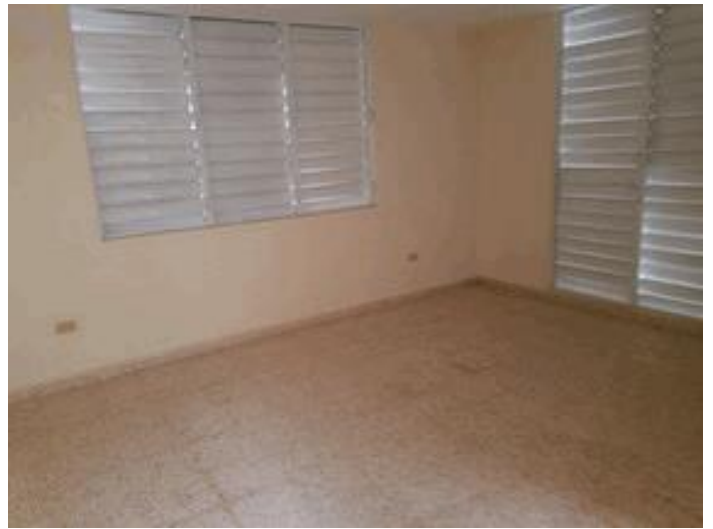
Bedroom and closet sampling