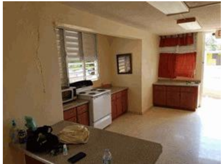
Laundry and kitchen area