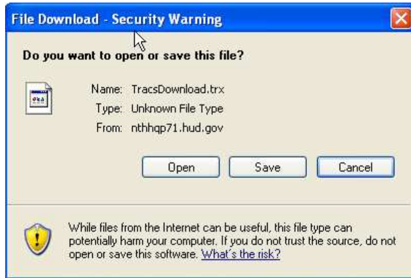
Figure 2. Security Warning Screen