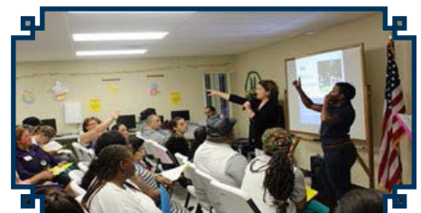
Residents should ask about any impacts converting to Section 8 may have on their rent, repairs that might be done on the property, and whether residents will need to be relocated temporarily.

PHA Plan. Note that in addition to meeting with residents of the converting project, a PHA must also amend its PHA Plan to reflect the proposed RAD conversion and solicit community input. As part of this process, a PHA will hold separate public meetings and collect comments.