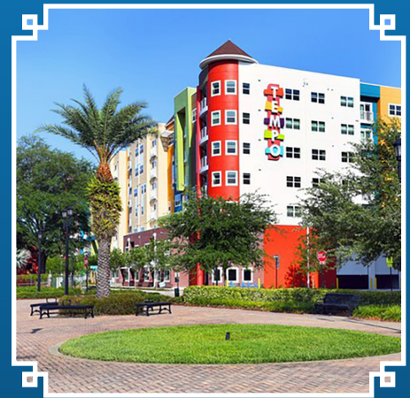
The Tempo at Encore, Tampa Housing Authority

Public Housing Agencies (PHAs) use the Rental Assistance Demonstration (RAD) Program to preserve affordable housing and improve properties by "converting" their form of federal assistance to the Section 8 program. PHAs choose to convert to either: Section 8 project-based voucher (PBV) or Section 8 project-based rental assistance (PBRA).