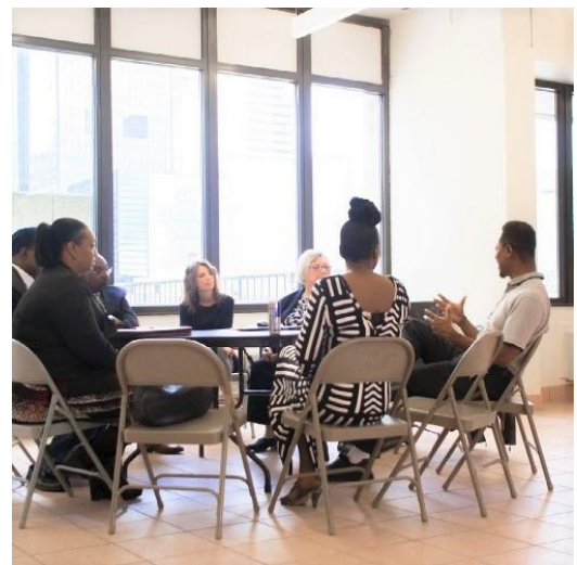
Photo: RAD Residents in Cleveland, OH

Residents of properties converting through RAD have a right to be informed about the conversion process and how it impacts them. To support resident education and assist PHAs as they engage with residents, HUD has produced 15 topical fact sheets , available in English and Spanish. These fact sheets cover a resident’s rights before and after a RAD conversion, how the conversion process works, and other topics. Now available in English and Spanish , we hope that these fact sheets will continue to be helpful in explaining to residents how the RAD conversion would impact their rights and their housing.