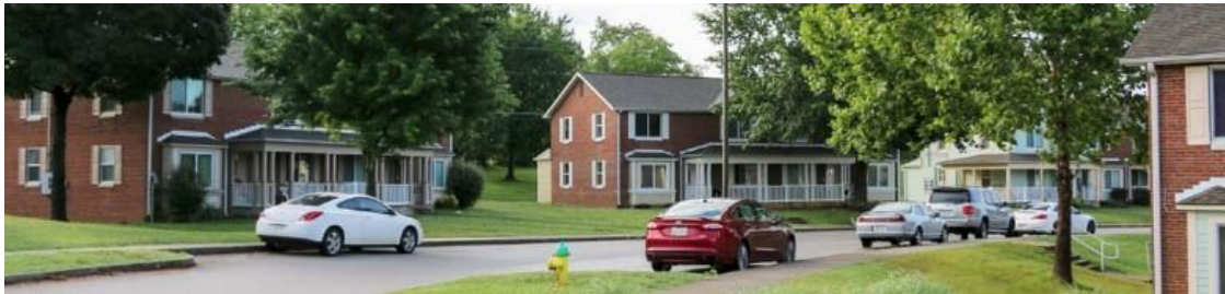
Lonsdale Homes, Knoxville, TN