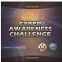
CyberAwareness Challenge (for DoD and Federal Personnel) October 2012