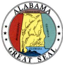
Kay Ivey Governor

Gordon Persons Building 50 N. Ripley St. P.O. Box 304000 Montgomery, AL 36130-4000 (334) 242-1310 dhr.alabama.gov