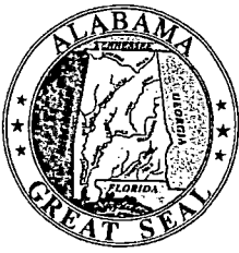
Kay Ivey Governor

Gordon Persons Building 50 N. Ripley St. P.O. Box 304000 Montgomery, AL 36130-4000 (334) 242-1310 dhr.alabama.gov