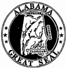
Kay Ivey Governor