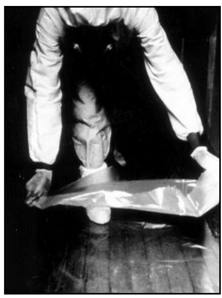
Figure 8.4 Apply a Second Layer of Plastic.

The first case involves floor sanding. Even if the paint has already been removed, leaded dust generation is likely to be quite high due to residual dust in the flooring. Enclosing old