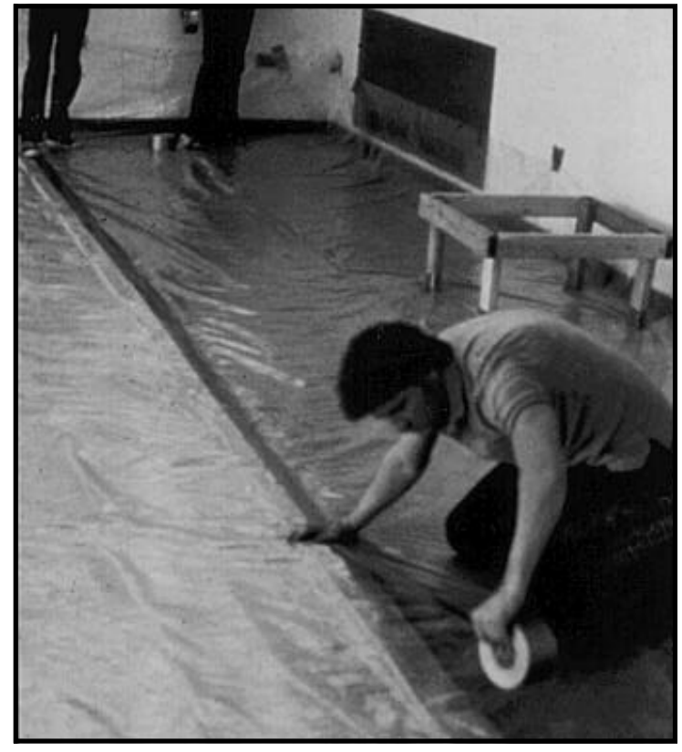
Figure 8.3a Prepare the Worksite With Plastic Sheeting (interior).