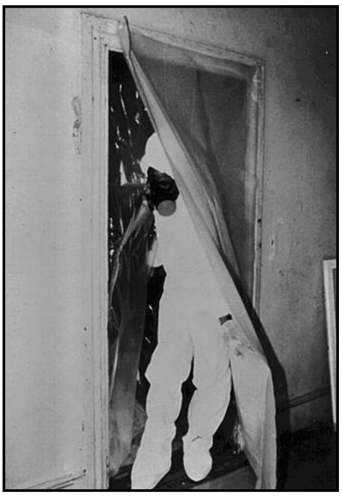
Figure 8.6 Install a Simple Airlock Over a Doorway to Minimize Lead Dust Migration.

some reason abrasive blasting without local exhaust ventilation is performed on the interior of a dwelling, a full containment structure with HEPA filtration and adequate airflow should be required. Such a containment system would also be necessary if the exterior of a dwelling was blasted, usually resulting in "tenting" an entire building (i.e., erecting a temporary tent-like structure around a building or one face of a building).