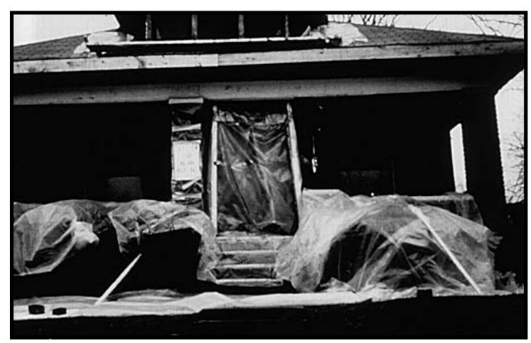
Figure 8.3b Prepare the Worksite With Plastic Sheeting (exterior).