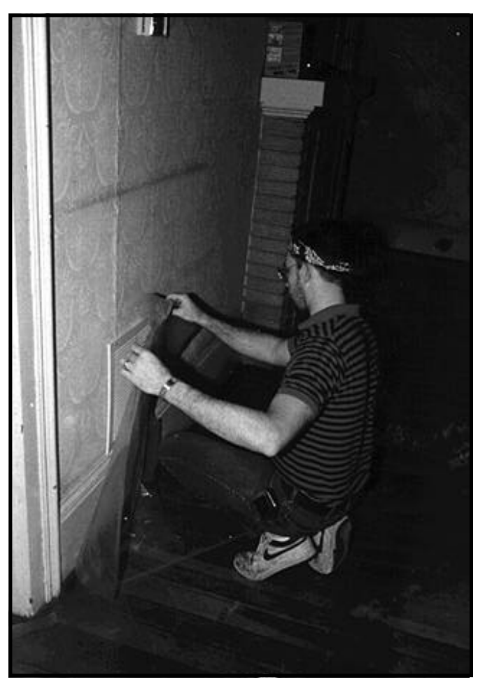
Figure 8.5 Cover the Air Vents With Plastic After Turning Off the HVAC System.