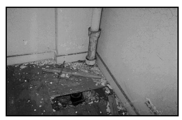
Figure 8.2 Area Should Be Precleaned and Structural Deficiencies in Flooring Repaired Before Lead Hazard Control Begins.

If bathrooms are not accessible, residents should always be relocated during the day (Table 8.1, Level2 at a minimum) unless alternative arrangements can be made (e.g., use of a neighbor's bathroom). In addition, if construction will result in other hazards (such as exposed electric wires), then residents should also be relocated.