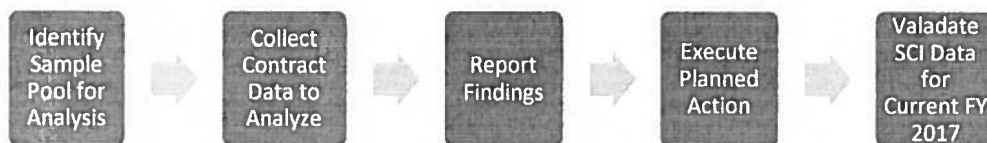
Figure 1: Analysis Process

To validate this review, HUD utilized tasks annotated in the Statement of Work (SOW) and/or Performance-based Work Statement (PWS) against FAR Subpart 7.5 to determine if the contractors were performing inherently governmental functions. HUD assessed labor categories to determine whether a program or project manager was included as part of the technical approach. Additionally, the coding associated with inherently government functions, found in the description of each identified FPDS-NG record, was compared to the contract terms and conditions to ensure accuracy in reporting. Finally, pursuant to FAR Subpart 4.17, HUD reviewed the System for Award Management (SAM) to ensure the contractors information on the amount invoiced and the direct labor hours expended on covered service contracts had been entered appropriately.