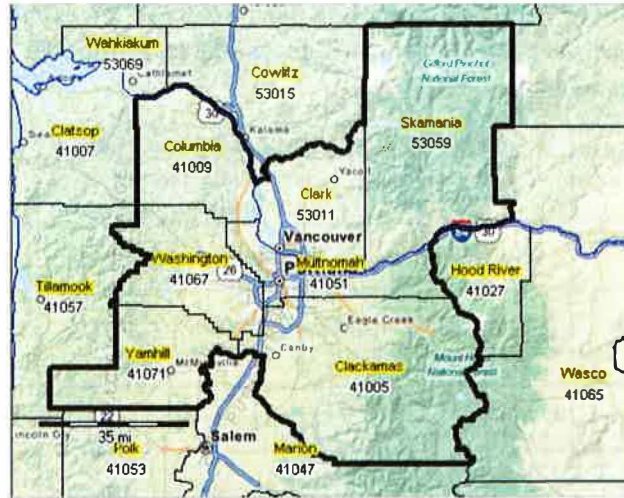
Figure 1: Portland/Vancouver Metropolitan Statistical Area

Clackamas County is an urban and rural county within the Portland/Vancouver metropolitan statistical area (figure 1). The US Census Bureau estimates a population size of 422,537 as of July 1, 2021, with the majority of those residing in the urban area adjacent to Multnomah County (to the north) and Washington County (to the west). It encompasses 1,879 square miles.