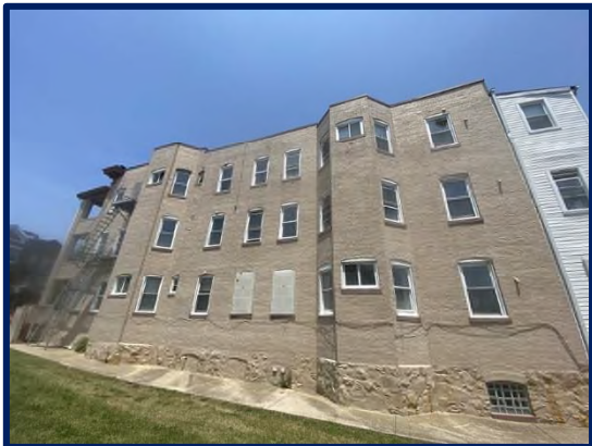
Exterior of building