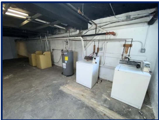
Laundry room in basement