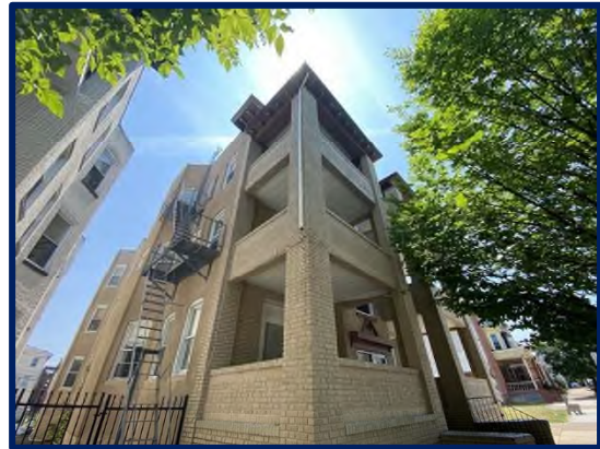
Exterior of building