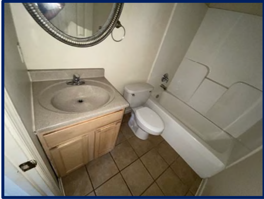
Bathroom in a unit