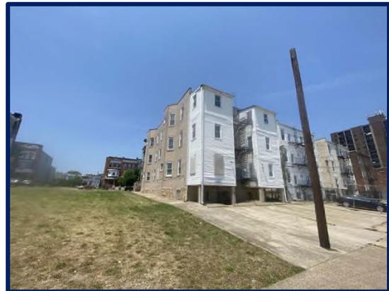
Rear of property