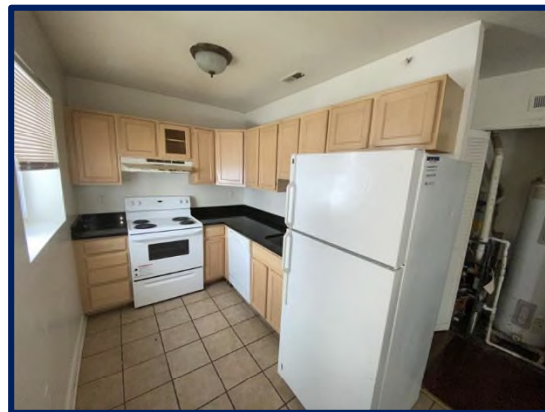
Kitchen in a unit