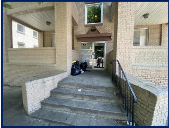
Entrance to building