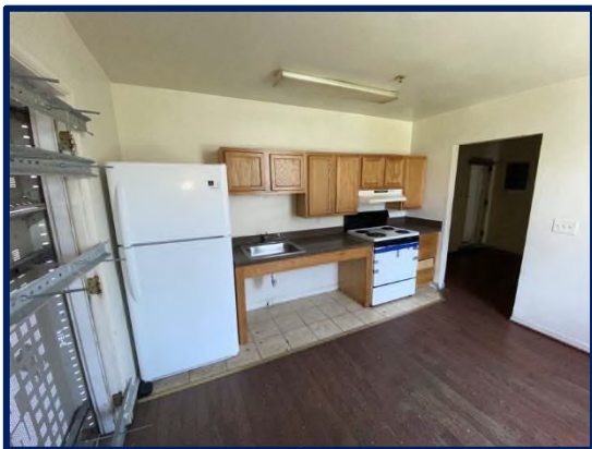
Kitchen in a unit