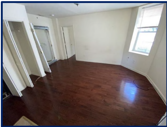
Living room in a unit