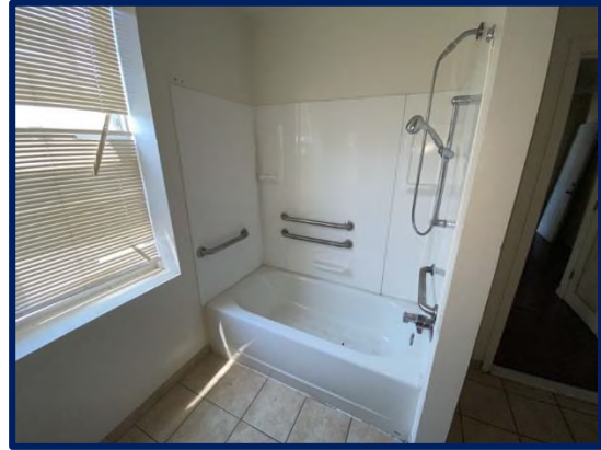
Bathroom in a unit