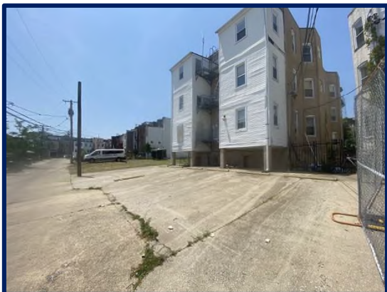
Rear of property showing parking