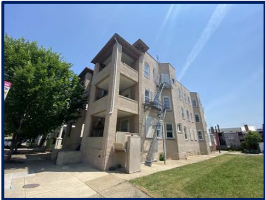
Exterior of building