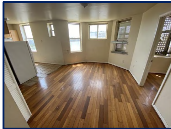
Living room in a unit